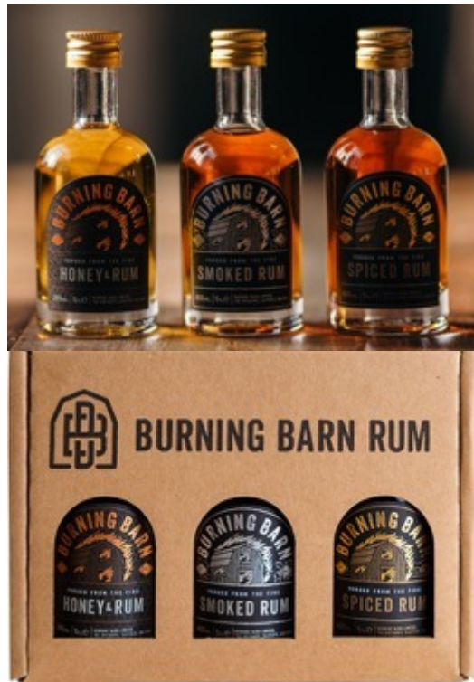
Case 18 Gift Packs (3 x 5cl)