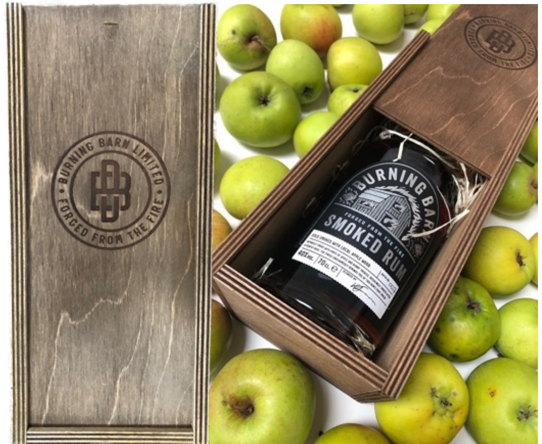
Limited Edition : Case 6 x 70cl Wooden Case